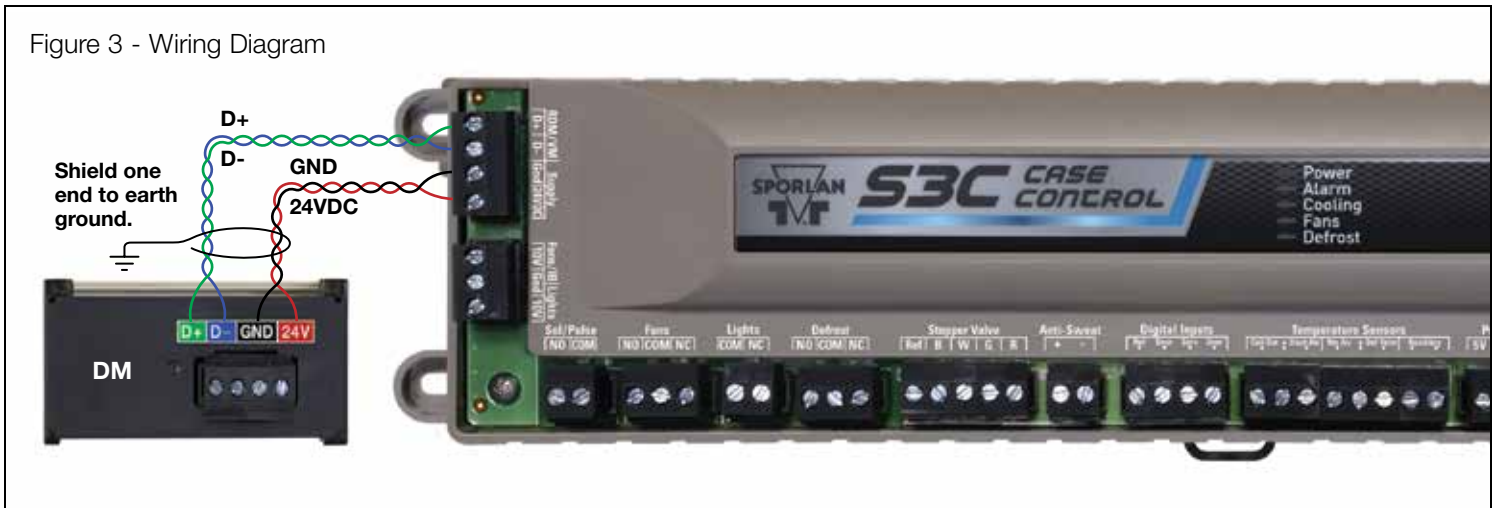
Figure 3 - Wiring Diagram

Diagram for reference only. Refer to input/output electrical ratings for all external connections. For safety information, see the Safety Guide at www.parker.com/safety or call 1-800-CPARKER.